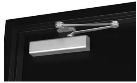
HDN arm (without stop) shown