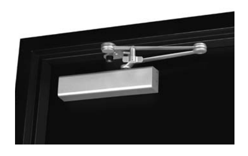
HDH arm (with stop) shown