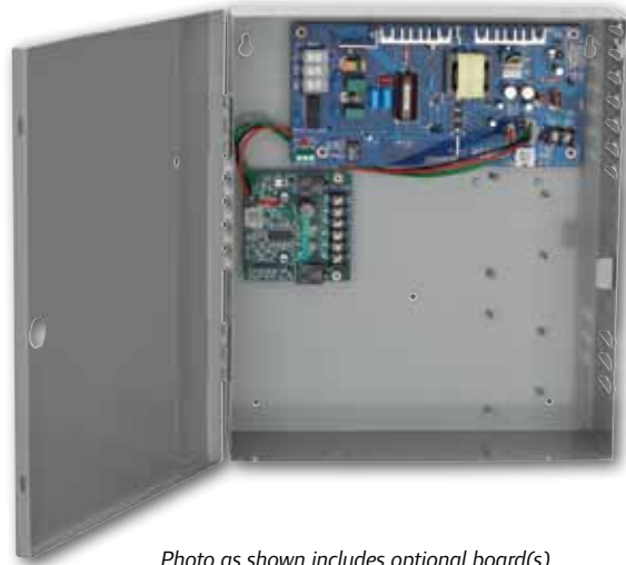
Photo as shown includes optional board(s) Please contact your local sales office or visit the support section on our website for configuration assistance.

* All PS900 Series of power supplies and option boards have been tested and certified to meet UL 294.